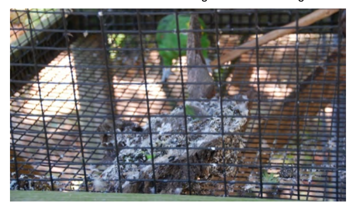
Catoctin staff needs to clean the filthy Amazon parrot cage, which probably had not been cleaned in at least six months.