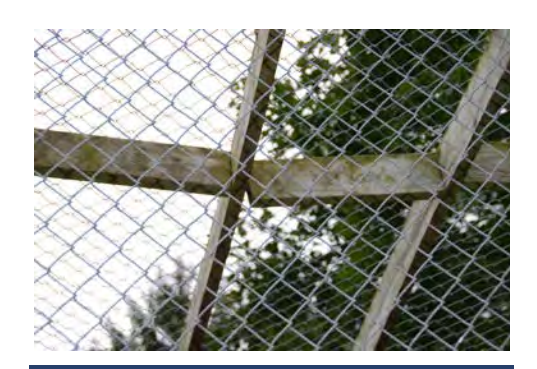
Crossbeams supporting the chain link roof for the adult bears at Plumpton Park Zoo appeared to be structurally unsound, which could create an opportunity for a bear to escape.

Numerous enclosures at Plumpton Park Zoo were filthy and foul-smelling. Cage areas and surrounding structures contained clutter, debris, and old bedding. There was a lack of attention to general facility maintenance and numerous areas were in various stages of disrepair. Electrical extension cords were haphazardly strung about fencing, cages, and trees posing a risk of fire, electrical shock, and loss of power. The cage sizes were inadequate for wideroaming carnivores, fencing was bowed and sagging in several areas, and cages for numerous animals lacked adequate privacy areas or features such as trees, shrubs, rocks, tree limbs, or artificial objects.