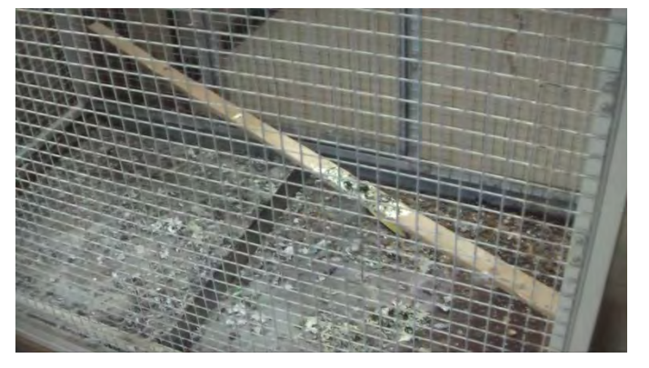
Plumpton Park staff need to clean the filthy cage for the blue and gold macaw, which has not been cleaned in weeks.