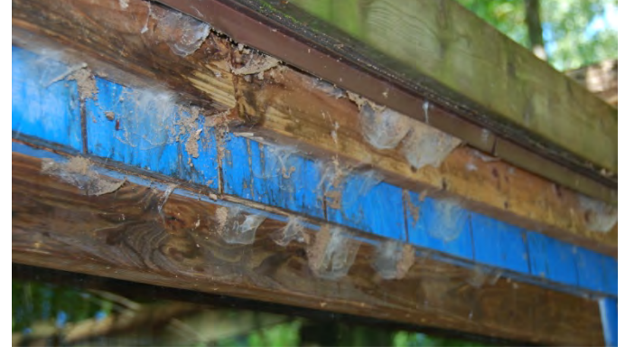
Catocin staff needs to clean the many cobwebs and other unsanitary conditions found at the zoo.