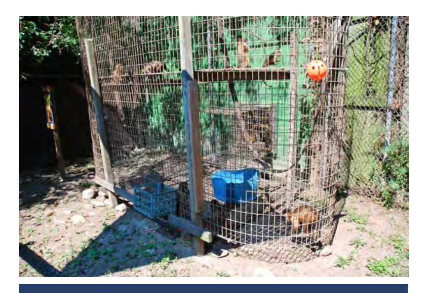
This capuchin cage is not large enough for one capuchin, let alone the dozen capuchins listed in Catoctin Zoo's inventory.

Food for the crowded, undersized capuchin cage ended up on the ground beneath the wire flooring, raising concerns that some animals may not be receiving an adequate diet and that the food becomes contaminated with excrement. There were an insufficient number of perches and the cage space was inadequate for the number of animals.