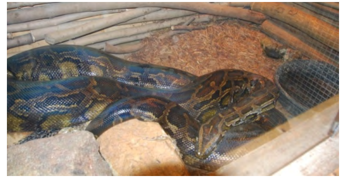
The cage size was inadequate for the Burmese python at Plumpton Park. In addition, the cage design was extremely dangerous, with no way to safely remove the snake and the cage had not been cleaned for several weeks or months.