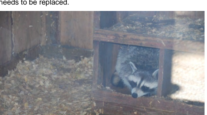
The raccoon at Catoctin had no outdoor area and the housing structure was dark, poorly ventilated, dirty, and dusty.