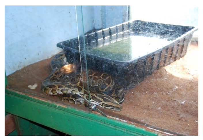
Tri-State staff needs to clean the filthy reptile cages and provide the animals with clean water.