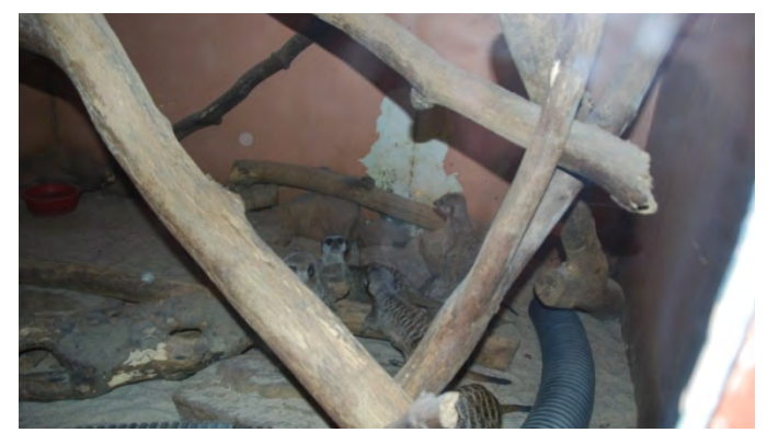
Meerkats are known for their sunbathing, but the meerkat cage at Catoctin was inside a dark building with no natural light.