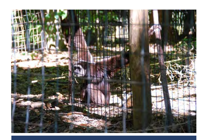
A bored, solitary gibbon at Catoctin Zoo lacks companionship.

Primates are extremely intelligent and lead busy, active, stimulating lives. Most are highly social and naturally live in pairs or family groups with whom they travel, groom, play, build nests, sleep, and raise their offspring. Many primates spend up to 70 percent of their waking hours in foraging-related activities. Primates have excellent climbing abilities and many are arboreal. All too often, captive primates in roadside zoos are denied mental stimulation, sufficient exercise, proper diets, and interaction with others of their kind. Abnormal behaviors for primates kept in poor