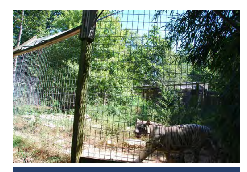
The fence for the tiger enclosure at Catoctin Zoo may not be high enough to safely contain a tiger.

It has been documented that tigers are able to jump at least 16-feet vertically, yet one of the white tigers at Catoctin Zoo was housed in an enclosure with an estimated 10-foot high fence with a two-foot kick-in (the top portion of the fence turned inward toward the exhibit at a roughly 45-degree angle) that may have been insufficient to safely contain the tiger. <sup>51</sup> Additionally, the chain link fencing to the left of the public viewing area for the tiger cage was flimsy, bent, and sagging and there was a