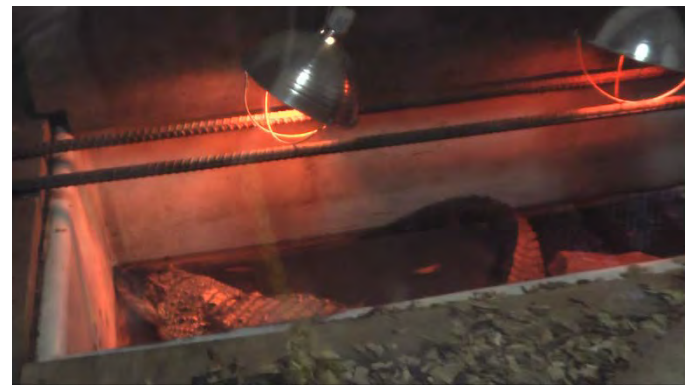
The alligator tub at Plumpton Park was was much too small, had dirty water, and was not deep enough. The alligator could potentially access the two heat lamps above the tub.