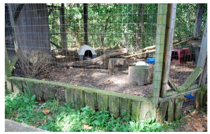
Tri-State needs to repair the broken base of the skunk enclosure that had pieces of missing and broken wood.