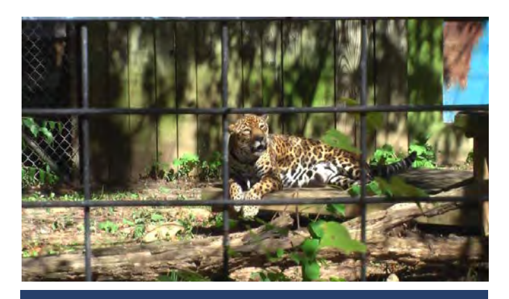
The jaguar is likely able to reach his leg through the wide gaps in the fencing at Catoctin Zoo.

In 2009, an animal care worker at Catoctin Zoo was critically injured by one, and possibly two, jaguars after she failed to secure the animals' inside area before working in it. Both jaguars entered the area and the woman was attacked by the nearly 200-pound male jaguar and possibly the female jaguar as well. Employees used a shovel, a 2-by-4 piece of lumber, and a fire extinguisher to fend off the jaguars. The keeper spent 10 days in the hospital for injuries to her face and upper body. The