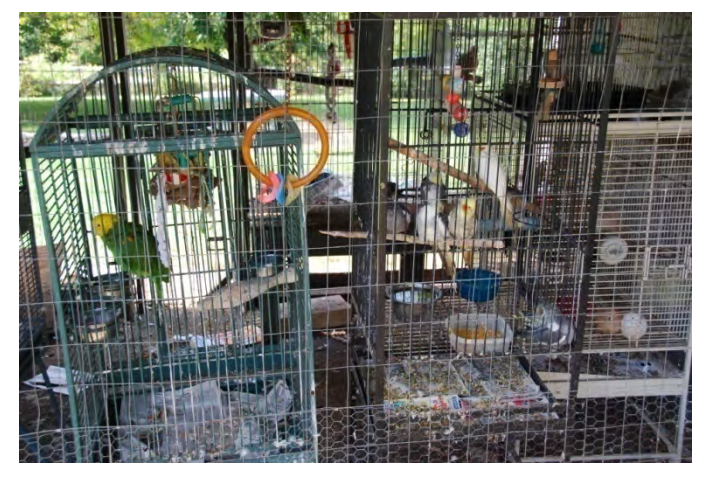
Tri-State staff needs to clean the dozens of extremely filthy bird cages.