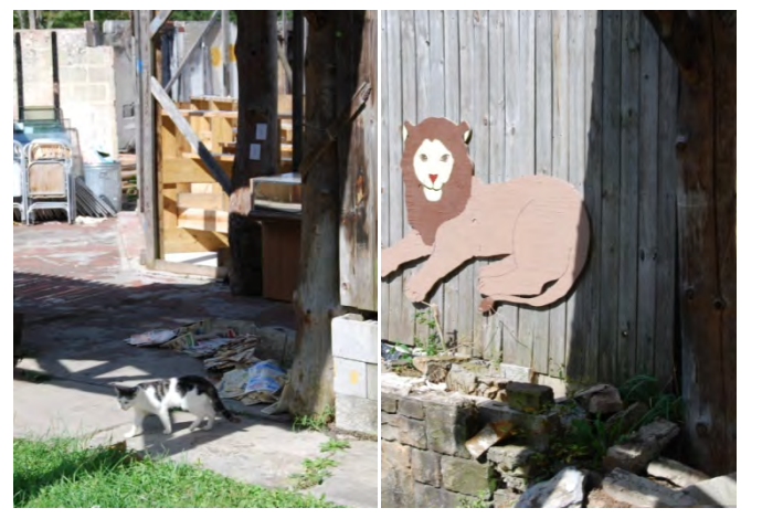
Tri-State needs to clean up the cluttered premises and repair crumbling areas.