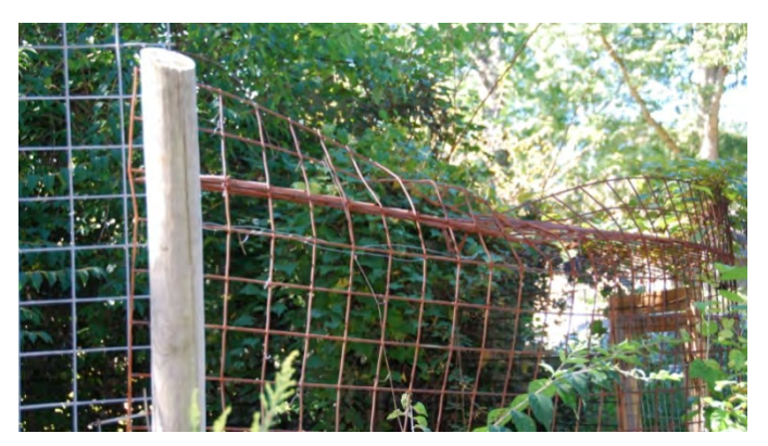
The bent, rusty portion of the fencing for Catoctin's dingo cage needs to be replaced.