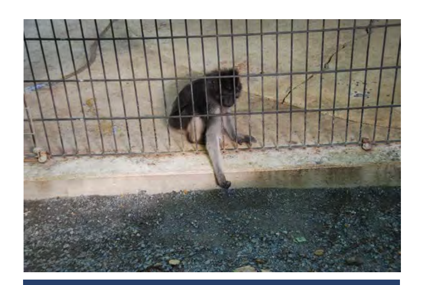
Without adequate enrichment, this young macaque at Catoctin Zoo tried to entertain himself by grabbing a handful of gravel.

There were several problems with the mixed lemur exhibit. A single brown lemur was observed in the cage that contained several ringtailed and ruffed lemurs. Brown lemurs are a more timid and much