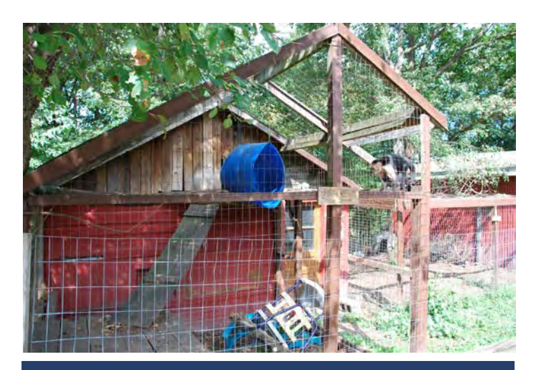
The capuchin monkey at Tri-State Zoo was housed alone and the cage lacked appropriate enrichment and furnishings.

Of particular concern, there was no staff present when The HSUS experts arrived at Tri-State Zoo and they were able to access the petting zoo area where the lemur and macaque cages were located. A lack of appropriate enrichment and a buildup of feces on resting surfaces were evident in these cages. The capuchin was singly-housed and lacked appropriate enrichment and cage features. The indoor area of the squirrel monkey cage contained filthy glass and walls.