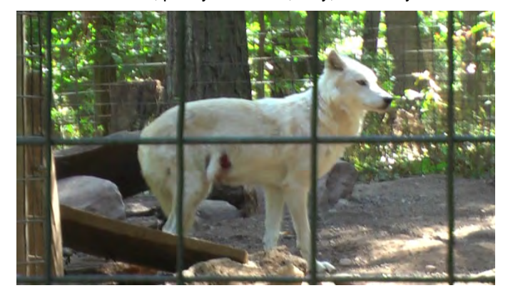
The wolves at Catoctin, including this one with a large raw wound, need a much larger enclosure and more privacy areas for a wolf to retreat to in the event of conflict.