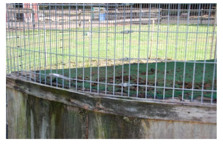
Tri-State staff need to clean the filthy coatimundi cage which had an excessive accumulation of feces.