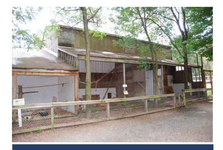
Plumpton Park's old-fashioned animal display cages are woefully behind current industry standards.