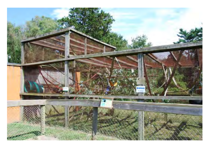
Unlike the small siamang cage pictured above at Plumpton Park Zoo, the AZA-accredited Oakland Zoo provides its two siamangs with a 75-foot long island that includes multiple climbing structures up to 30-feet tall.

The experienced and trained professionals at the AZA-accredited Oakland Zoo house their two middle-aged siamang brothers on an island measuring 75-feet long and 45-feet across at the widest point. The Oakland Zoo makes extensive use of vertical space to provide natural behavioral opportunities for the animals. There are four 20-foot high palm trees, three 15-foot high Acacia trees, and four 30-foot high poles with resting platforms. There are also nearly a dozen 10-foot high metal sway poles placed at a variety of angles and interconnected with