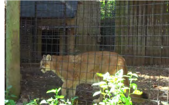
A cougar at Catoctin Zoo was euthanized after being attacked by a wolf in an adjacent cage.