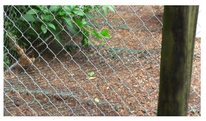
The foul-smelling jackal cage at Plumpton Park needs cleaning, enlargement, and privacy areas and the buckled, exposed chain link flooring needs to be replaced to prevent a jackal from getting a paw or leg stuck.