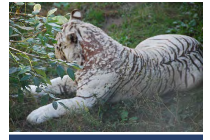
An overweight white tiger with a skin condition at Tri-State Zoo.