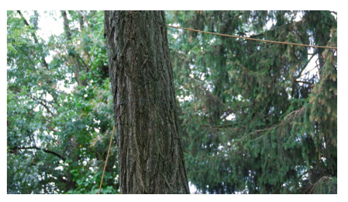
Plumpton Park needs an electrician to replace the extension cords haphazardly strung about fencing, cages, and trees with permanent wiring.