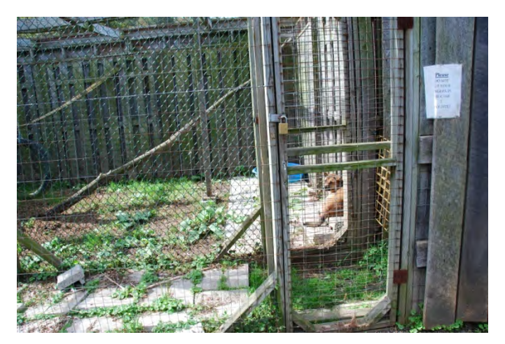
The cage for the New Guinea singing dog at Tri-State was smaller than the backyards most people provide for their domestic dogs and the cage lacked enrichment.