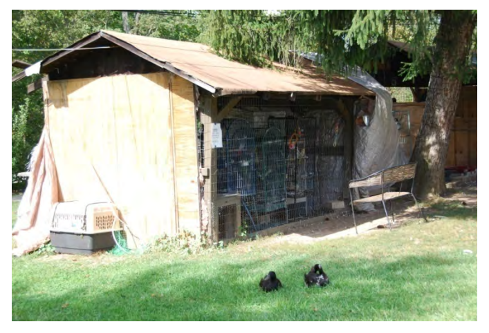
Tri-State needs to construct aviaries to eliminate the extreme overcrowding of the caged birds.