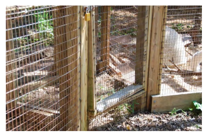
The two arctic foxes at Plumpton Park need a bigger cage with privacy areas and a properly constructed door to ensure the animals are safely contained.