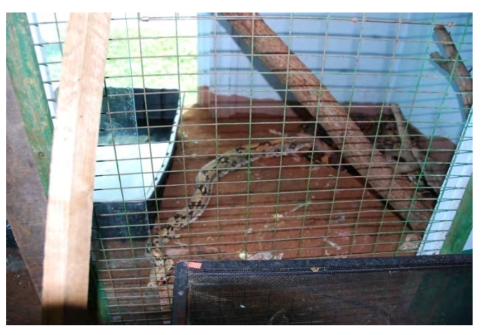
Tri-State needs to ensure safe containment of the boa constrictor kept in a cage with one side constructed of wire gauge fencing, which could allow the snake to escape.