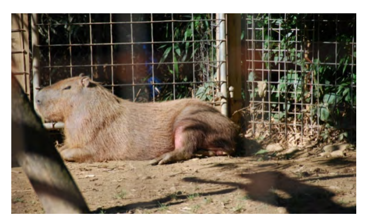
The two semi-aquatic capybaras with red, irritated skin at Catoctin are in need of a pool.

Illustrated in this section are a few of the many other problems observed by The HSUS experts during site visits to Catoctin Zoo, Plumpton Park Zoo, and Tri-State Zoo. Limiting the possession of big cats, bears, and primates to AZA-accredited institutions would allow these roadside zoos to focus on improving conditions for the other species in their care, such as the following issues observed in September 2013.