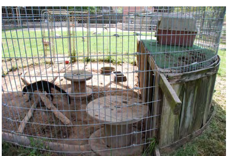
There was an accumulation of feces in several cages at Tri-State Zoo, including the coatimundi cage.