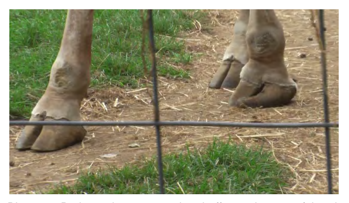
Plumpton Park needs to ensure the giraffe receives careful and routine nail trimming, including for the nail growing inwards on the left front foot, to prevent lameness or injury.