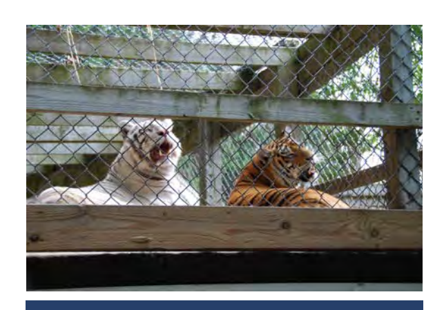
In 2012, Plumpton Park Zoo acquired a pair of tigers from a defunct roadside zoo in Wisconsin.

Despite having inadequate caging for big cats and insufficient staff, the Plumpton Park Zoo acquired a pair of 1-year-old tigers in September 2012 from a defunct roadside zoo in Wisconsin. <sup>60,61</sup> The zoo has